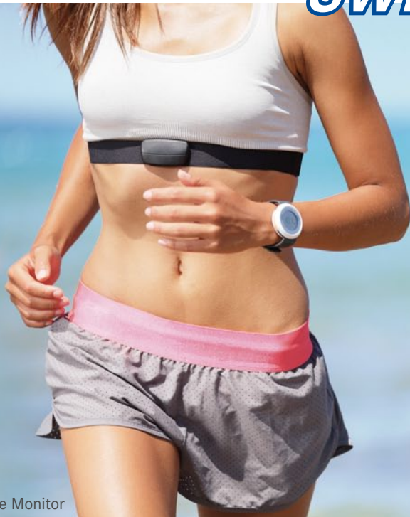
Heart Rate Monitor

Amphenol LTW introduces another breakthrough innovation SWIFT, IP67/IP68 Stand-Alone Micro-USB 2.0 the first waterproof micro-USB to blend with your wearable devices!