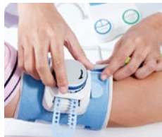
Digital Pressure Monitoring