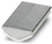
Insertion profile, Color: silver