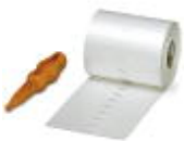
Marker for terminal blocks, Roll, white, Unlabeled, Can be labeled with: THERMOMARK ROLL, THERMOMARK X, THERMOMARK S1.1, Unperforated, Mounting type: Snap into universal marker groove, Snap into flat marker groove, Lettering field: 6.35 x 101.5 mm

Marker for terminal blocks - TMT 100 R - 0816605