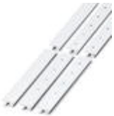
Zack marker strip, Strip, white, Unlabeled, Can be labeled with: Plotter, Mounting type: Snap into tall marker groove, For terminal block width: 15.2 mm, Lettering field: 10.5 x 15.1 mm

Zack marker strip - ZB 15:UNBEDRUCKT - 0811972