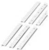
Zack Marker strip, flat, Strip, white, Unlabeled, Can be labeled with: Plotter, Mounting type: Snap into flat marker groove, Lettering field: 15 x 5.2 mm

Zack Marker strip, flat - ZBF 15:UNBEDRUCKT - 0811202