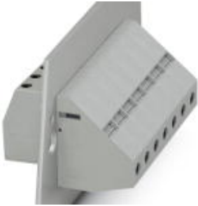
The illustration shows version HDFKV 25

Please be informed that the data shown in this PDF Document is generated from our Online Catalog. Please find the complete data in the user's documentation. Our General Terms of Use for Downloads are valid ( http://download.phoenixcontact.com )