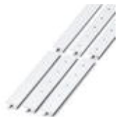
Zack marker strip, Strip, white, Unlabeled, Can be labeled with: Plotter, Mounting type: Snap into tall marker groove, For terminal block width: 20.3 mm, Lettering field: 10.5 x 20.25 mm

Zack marker strip - ZB 20,3:UNPRINTED - 0820248