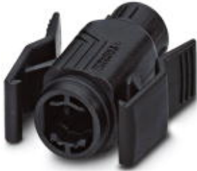
RJ45 sleeve housing, IP67, for pin insert VS-08-ST-H11-RJ45 and VS-08-ST-H21-RJ45, with push-pull interlocking for panel mounting frames, for cable cross section 5.0 mm ... 8.5 mm, color: black

Please be informed that the data shown in this PDF Document is generated from our Online Catalog. Please find the complete data in the user's documentation. Our General Terms of Use for Downloads are valid ( http://download.phoenixcontact.com )