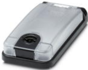
Mounting frame for one front plate/socket, frame: black, cover: transparent, closed with 3 mm two-way key bit.

Please be informed that the data shown in this PDF Document is generated from our Online Catalog. Please find the complete data in the user's documentation. Our General Terms of Use for Downloads are valid ( http://phoenixcontact.com/download )