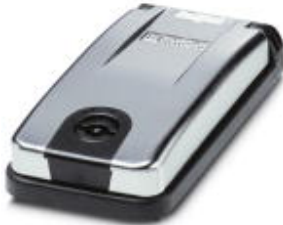
Mounting frame for one front plate/socket, frame: black, cover: metallic, closed with 3 mm two-way key bit.

Please be informed that the data shown in this PDF Document is generated from our Online Catalog. Please find the complete data in the user's documentation. Our General Terms of Use for Downloads are valid ( http://phoenixcontact.com/download )