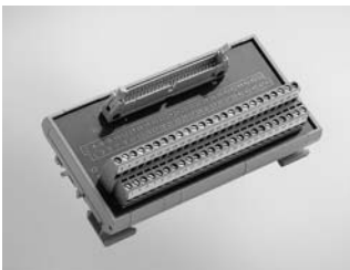
ADAM-3950 50-pin DIN-rail Flat Cable Wiring Board

PCI-1713U, PCI-1715U, PCI-1718H DU, PCI-1720U, PCI-1730U, PCI-1733, PCI-1734, PCI-1750, PCI-1760U, PCI-1761