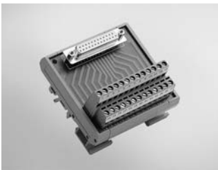
ADAM-3925 DB25 DIN-rail Wiring Board

PCI-1735U, PCL-711B, PCL-720+, PCL-726, PCL-727, PCL-730, PCL-812PG, PCL-816, PCL-818 Series, PCL-836