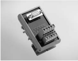
ADAM-3909 DB9 DIN-rail Wiring Board