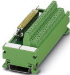
VARIOFACE module, with screw connection and D-subminiature socket strip, for assembly on NS 35/7.5, 9 positions

Please be informed that the data shown in this PDF Document is generated from our Online Catalog. Please find the complete data in the user's documentation. Our General Terms of Use for Downloads are valid ( http://download.phoenixcontact.com )