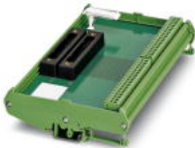
The figure shows version FLKM-2KS40/SPT/CS

Please be informed that the data shown in this PDF Document is generated from our Online Catalog. Please find the complete data in the user's documentation. Our General Terms of Use for Downloads are valid ( http://phoenixcontact.com/download )