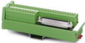
The illustration shows the version UM 25-D 9SUB/B/FRONT/Q

VARIOFACE SLIM LINE, with screw connection and D-subminiature pin strip, for assembly at a right angle on NS 35/7.5, 37 positions