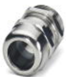
Cable gland, Cable gland material: Brass, nickel-plated, External cable diameter 13 mm ... 18 mm, Shielding: No, Connecting thread: Pg21, Color: silver

Cable gland - G-INS-PG21-M68N-NNES-S - 1411175