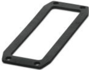
Replacement flat gasket, for HEAVYCON EVO panel mounting base type B16

Please be informed that the data shown in this PDF Document is generated from our Online Catalog. Please find the complete data in the user's documentation. Our General Terms of Use for Downloads are valid ( http://phoenixcontact.com/download )