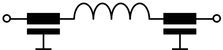
Typical Electrical Schematic