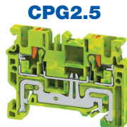
2 Connection Ground Terminal 2 Jumper Channels