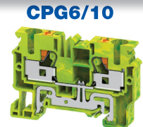
2 Connection Ground Terminal 2 Jumper Channels