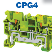
2 Connection Ground Terminal 2 Jumper Channels