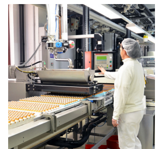
Food and Beverage Equipment