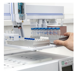
Test and Measurements here