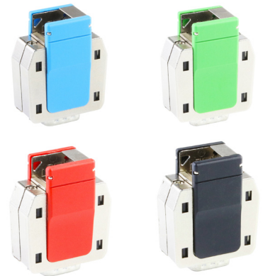
Jewel Backshells for D-Sub Connectors

Jewel Backshells for FCT D-Sub Connectors offer cable management by enabling a straight to 45-degree adjustment of the d-sub connector's orientation and provide click-and-close assembly, protection and strain relief