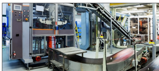
Industrial Automation Applications