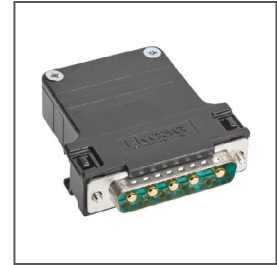
Plastic Backshells with D-Sub Connectors and Cable Assemblies