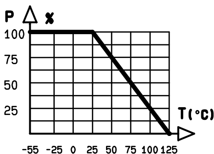
Power derating Versus temperature

Tentative data subject to change without notice